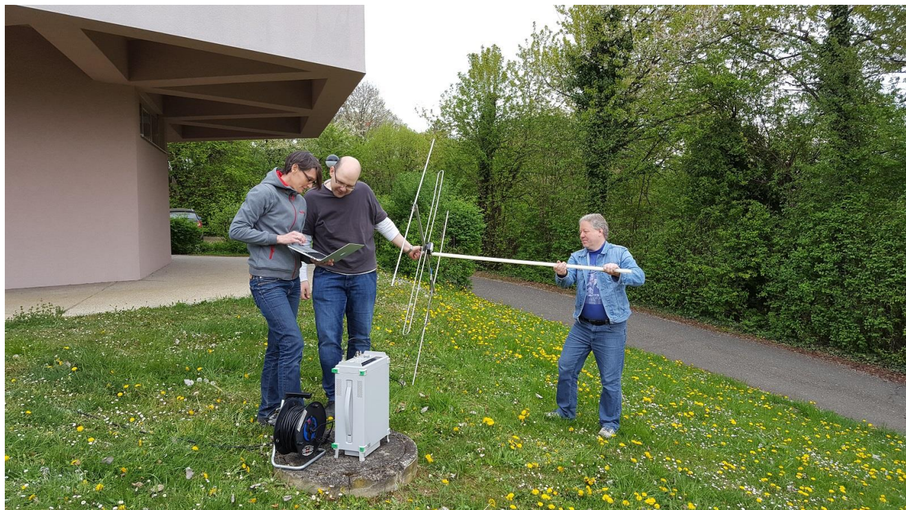
Fig. 3: Verification of polarization with a Yagi-antenna and a radio frequency signal generator