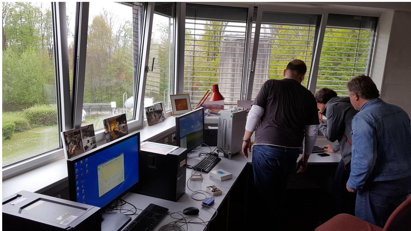
Fig. 2: Component testing with network analyser (NWA) in the control room of the (optical) observatory.