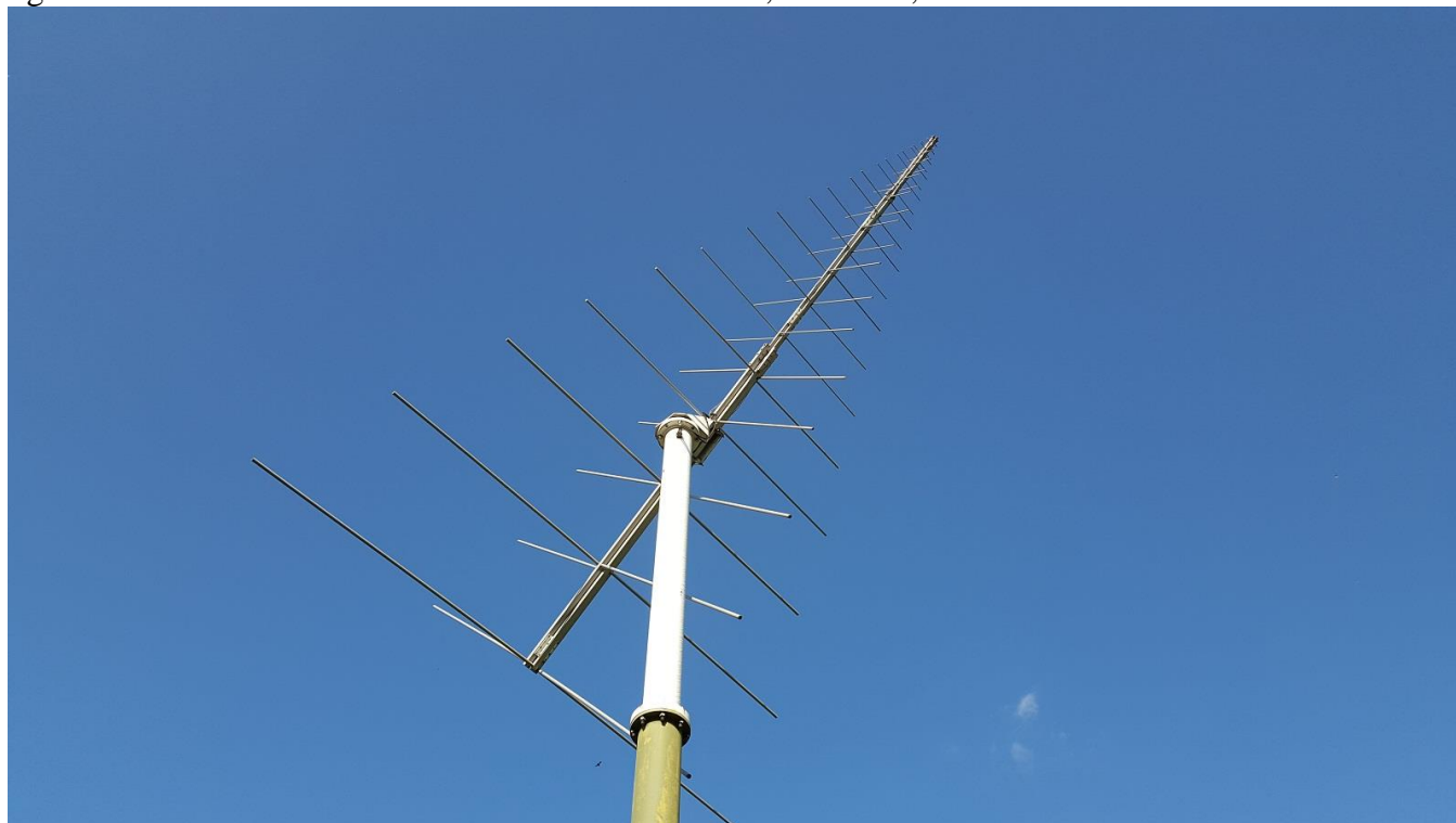
Fig 1: Dual polarization LPDA at fixed sky position to observe the Sun during transit.