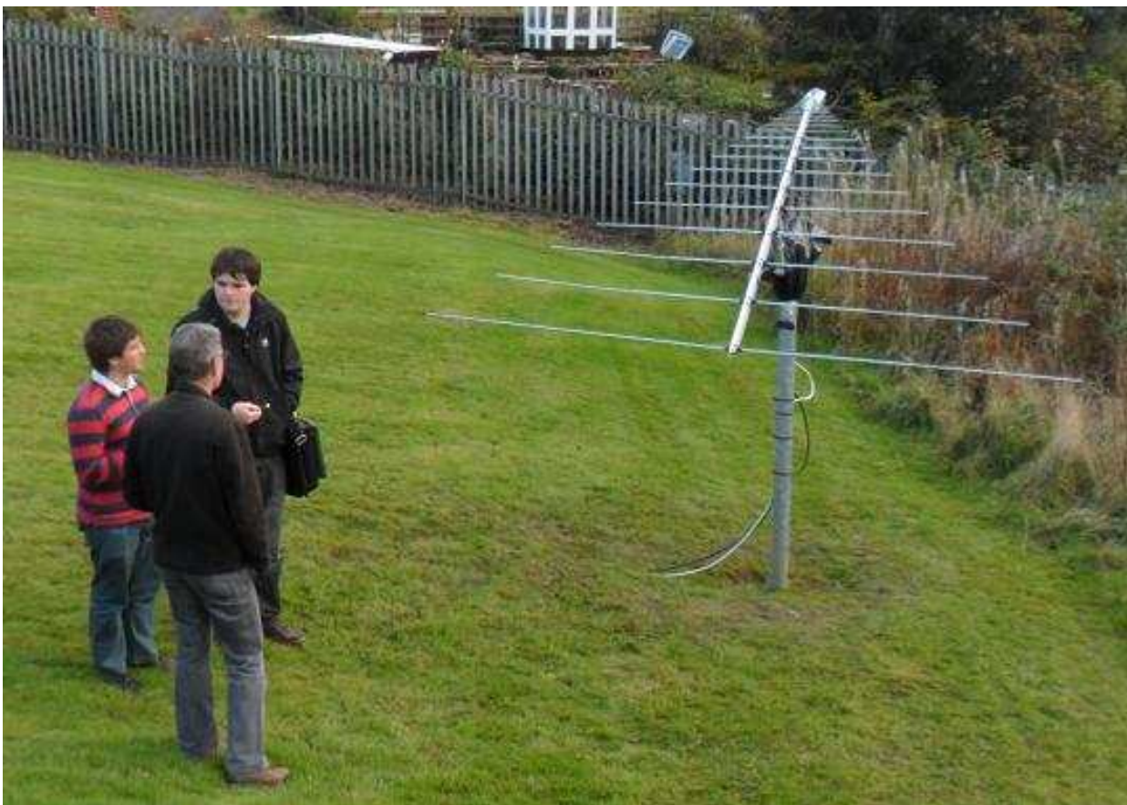
Fig. 1: Alex M. and two students beside the antenna discussing potential projects based on Callisto data. The instrument is foreseen for scientific solar observations as well as for students projects and 'bad-weather'-outreach activities.

The antenna is a commercial LPDA (Logarithmic Periodic Dipole Array) from CREATE CLP5130-1N connected to a low noise preamplifier Mini-Circuits ZX60-33LN with 20 dB of gain and 1.1 dB of noise figure. Data (GLASGOW*.fit) are already transferred in real time to the archive at FHNW in Switzerland.