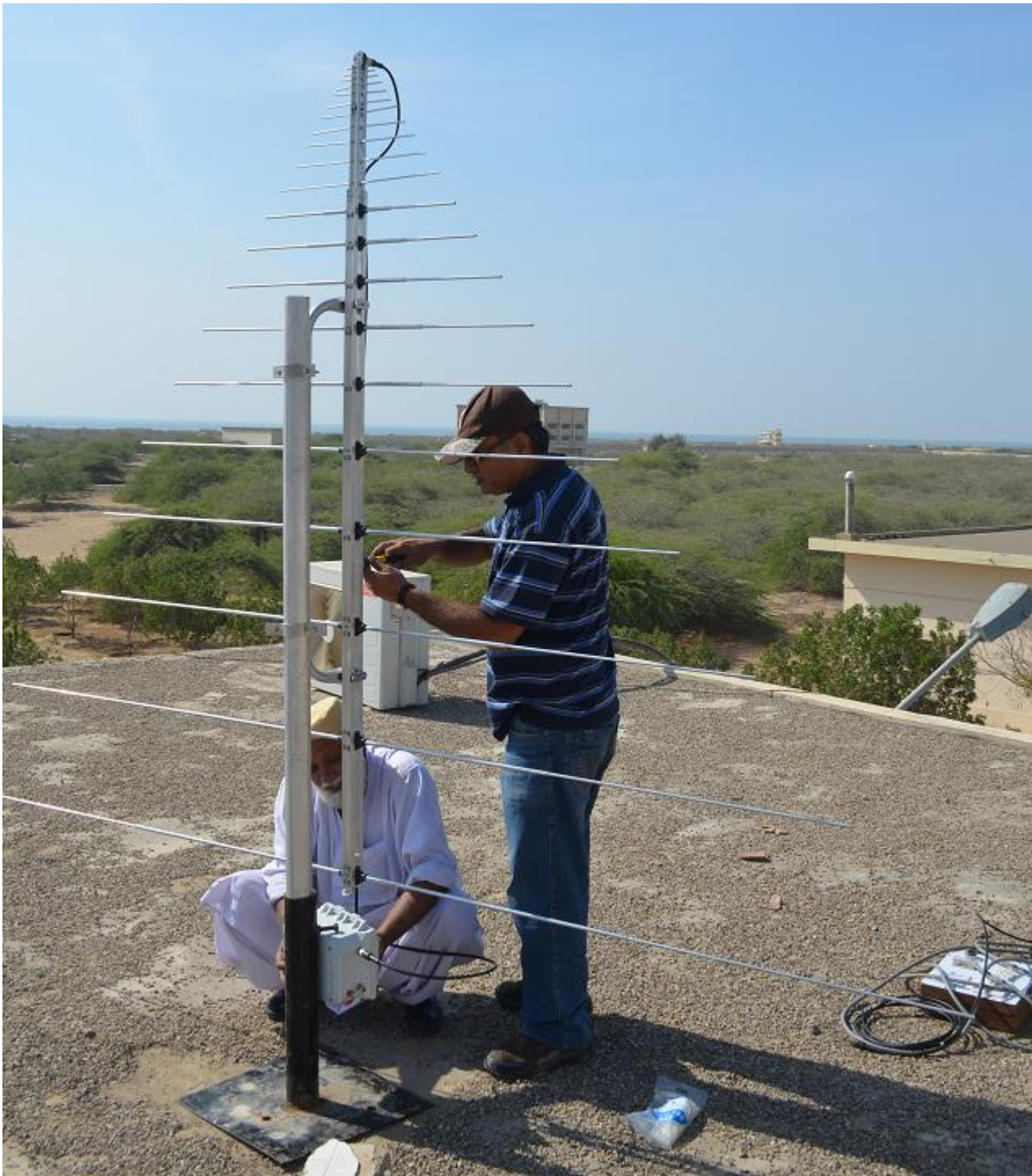
Fig 4: Installation of the LPDA on the roof of the observatory. The focal plane unit containing low noise amplifier was produced by W. Reeve in Anchorage, Alaska/USA.