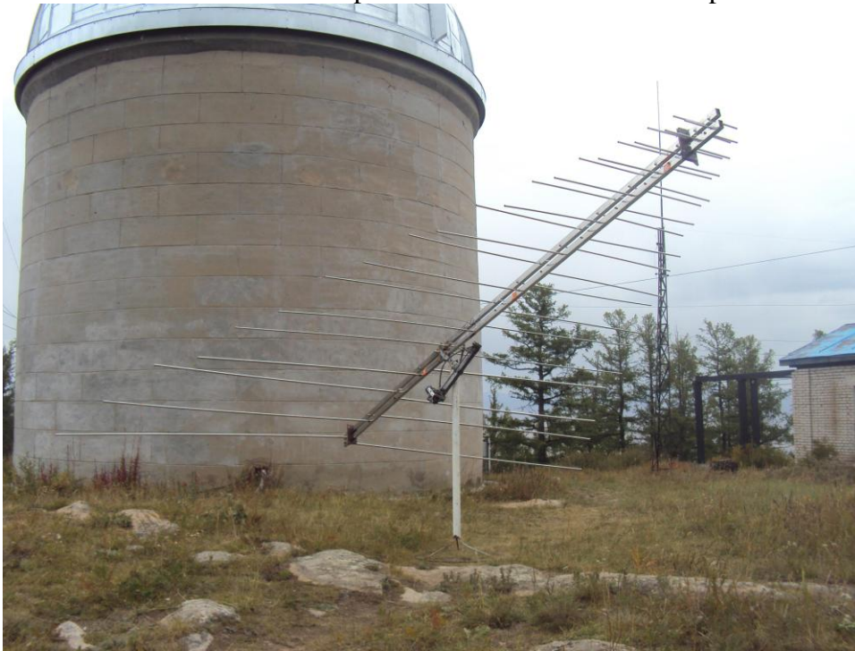
Fig. 5: Logarithmic periodic dipole array LPDA in front of an optical observatory in Mongolia.

A second Callisto solar radio spectrometer has been set into operation in a Mongolian desert.