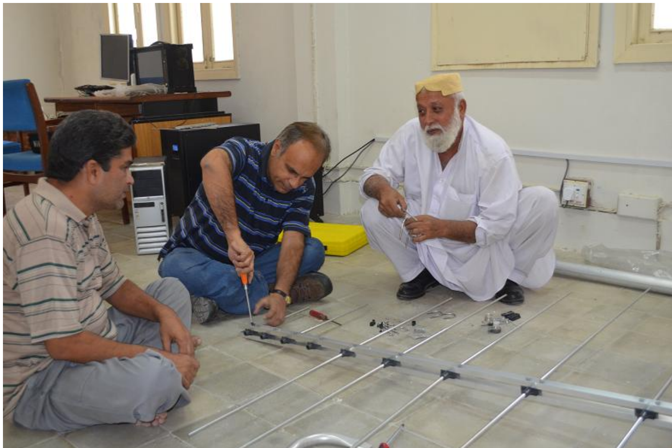
Fig. 3: Assembling of the logarithmic periodic dipole array LPDA at SUPARCO in Pakistan.