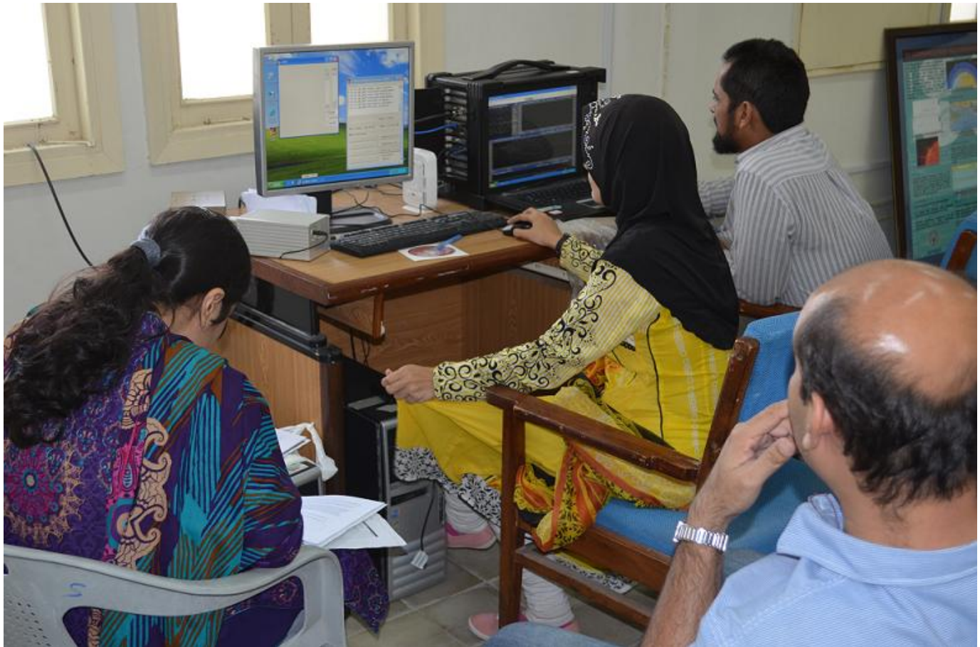
Fig. 2: Backend of the Callisto instrument inside the observatory