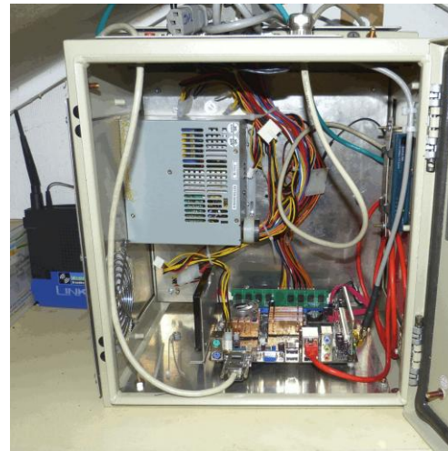
Figure 4 ~ Computer box containing a small low-power computer board, disk, switch and power supply.