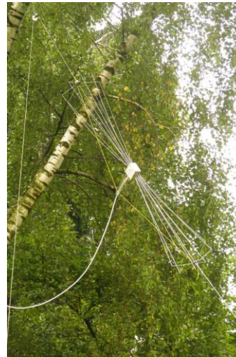
Figure 2 ~ The biconical antenna (called "Fliegenfischfänger" in German language, because it looks like a trap for flying fishes) mounted to a tree. The antennas directional sensitivity should follow the sun, so no tracking system is needed.